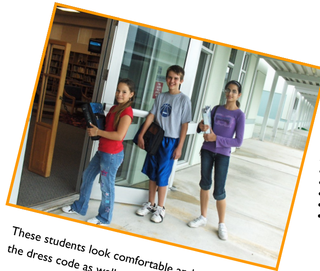
These students look comfortable and comply with the dress code as well.